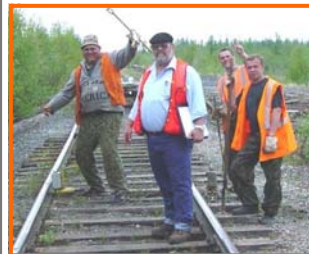
Me and a lining crew in Siberia. The big guy on the left had a sweat shirt that said America and the only English word he knew was New York.