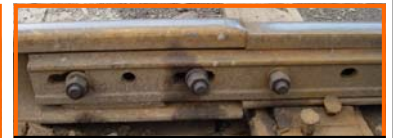
A home made compromise joint between R50 and R65 Rail using the standard R50 bars with a piece of re-bar welded on the underside for the R65 side and torched holes for the different hole drilling. No account was given to the head.