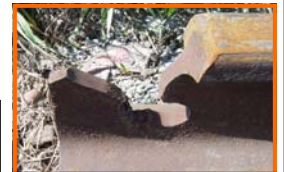
This is what happens when a hole is reamed with a torch.

A serious snow plow in the retracted condition.. There are steel teeth to break ice between rails. All snow is conveyed and cast to the side.