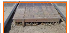
How is this for a highway grade crossing made out of rails welded together.