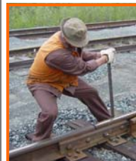
Tightening a joint. Note the very short track wrench. Not very ergonomic. This was the standard size in the 19th century. Also the handles in the shovels are tree branches.